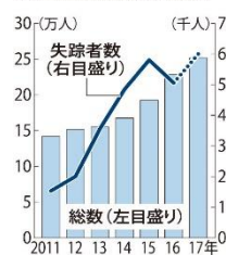
近年の技能実習生の 総数と失踪者数の推移 ※法務省への取材による。2017 年の実習生総数は6月末現在