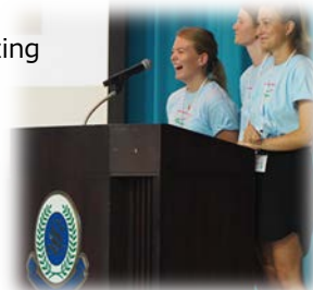
“Water is Life” high school conference, July 2018]