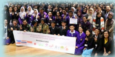
High School Students' ESD Symposium, Nov. 2018