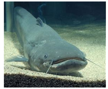
2 Biwako Ohnamazu