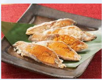
⑤ Funazushi (Traditional food)