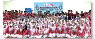
SMA Brawijaya Smart School