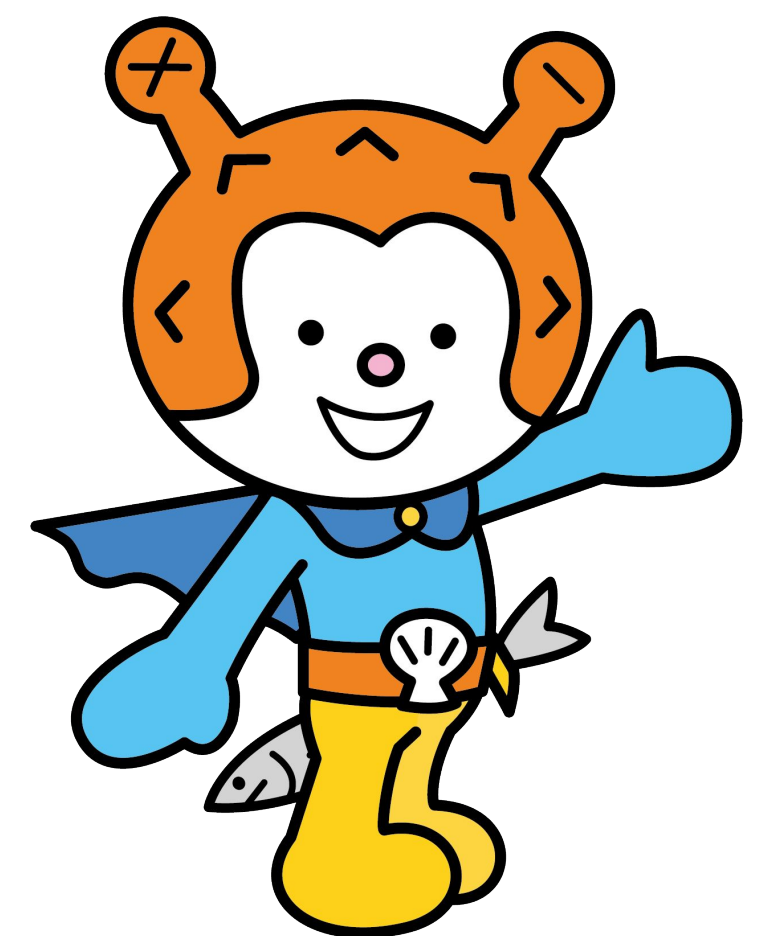
Kesennuma City Mascot, Hoya Boya the Ocean Boy

We want children to be able to protect their own lives by themselves.