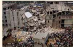
Fig. 1 Tragedy at Rana Plaza