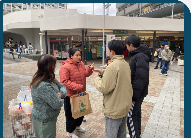
↑ IMAGE OF US GETTING ADVICE AND FEEDBACK FROM THE VOLUNTEERS WHO TOOK PART

After playing a couple games and wrapping up our small event up, we asked some questions to our kind volunteers to find out what their thoughts were on the game. Two Nepali adults suggested that we create a video or a demonstration instead of just a simple presentation style paper. Overall, people told us that what we were doing was a positive thing, and that it was enjoyable for them to experience a unique kind of sport.