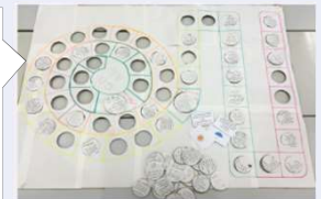
▲ Our prototype

Disaster Prevention Education in the Philippines is insufficient compared to Japan.